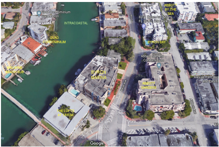
Built in 1982 - 40 units - 5 floors