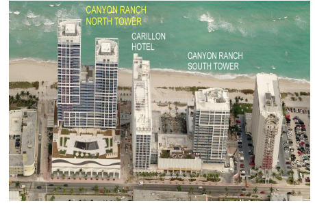
Built in 2008 - 207 units - 34 floors