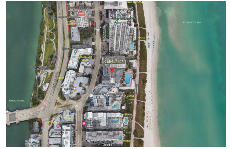
Built in 1948 - 285 units - 10 floors

Number of units: 285 Number of active listings for rent: 0 Number of active listings for sale: 4 Building inventory for sale: 1% Number of sales over the last 12 months: 16 Number of sales over the last 6 months: 5 Number of sales over the last 3 months: 2 THE CASABLANCA ON THE OCEAN 6345 Collins Ave, Miami Beach, FL 33141, +1 305-868-0010 https://