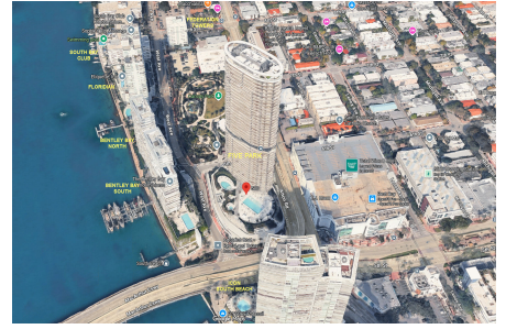
Built in 2025 - 226 units - 49 floors

Address: 500 Alton Rd, Miami Beach, FL 33139 Phone: +1 786-636-3125 https://