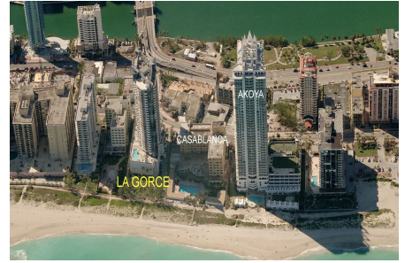
Built in 1995 - 207 units - 33 floors

La Gorce Condominium (305) 867-1665 http://lagorcepalace.com/