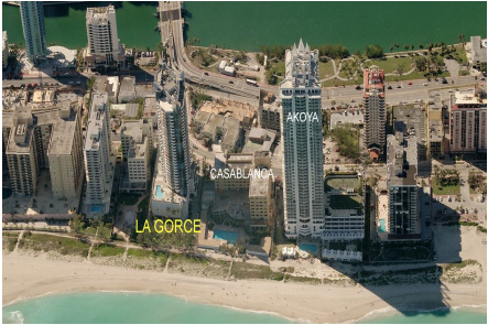
Built in 1995 - 207 units - 33 floors