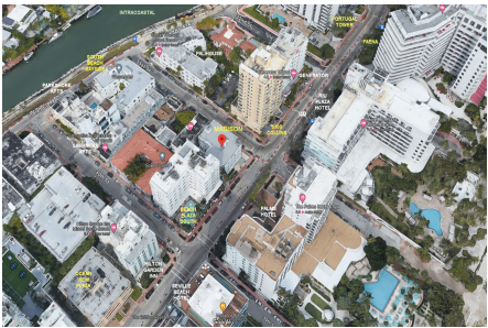
Built in 1941 - 32 units - 4 floors