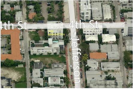
Built in 2004 - 6 units - 5 floors