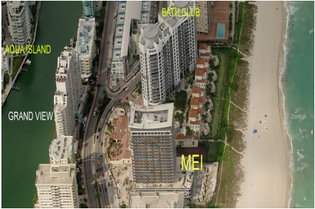
Built in 2008 - 134 units - 21 floors