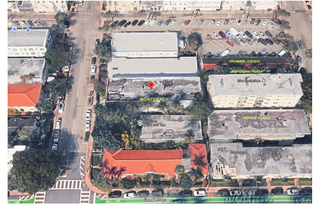
Built in 1938 - 27 units - 3 floors

Monterrey Condominium Property Association Inc 707 5th Street Miami Beach, FL 33139 (305) 532-5219 https://