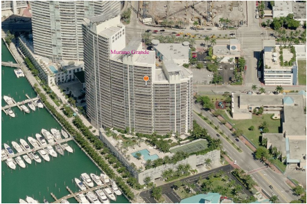
Built in 2002 - 270 units - 38 floors