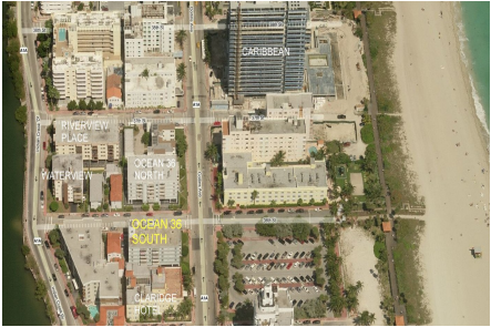
Built in 1990 - 24 units - 5 floors