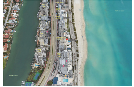
Built in 1967 - 297 units - 18 floors

https://www.oceansideplazacondominium.com/Page/2