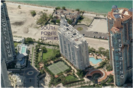
Built in 1987 - 205 units - 24 floors