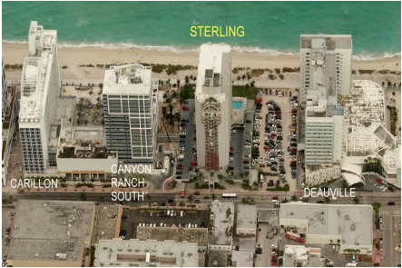
Built in 1991 - 184 units - 21 floors