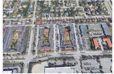
Built in 1968 - 75 units - 2 floors

Number of units: 75 Number of active listings for rent: 0 Number of active listings for sale: 0 Building inventory for sale: Number of sales over the last 12 months: 0%% Number of sales over the last 6 months: 0 Number of sales over the last 3 months: 0 New World Condominium III Address: 271 NW 177th St, Miami, FL 33169 Phone: +1 305-999-9700 https://