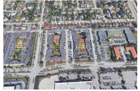
Built in 1969 - 84 units - 2 floors

Number of units: 84 Number of active listings for rent: 3 Number of active listings for sale: 5 Building inventory for sale: 5% Number of sales over the last 12 months: 1 Number of sales over the last 6 months: 1 Number of sales over the last 3 months: 1 New World Condominium III Address: 271 NW 177th St, Miami, FL 33169 Phone: +1 305-999-9700 https://