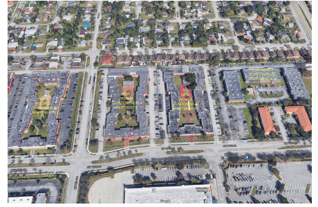
Built in 1971 - 126 units - 2 floors

Number of units: 126 Number of active listings for rent: 1 Number of active listings for sale: 5 Building inventory for sale: 3% Number of sales over the last 12 months: 4 Number of sales over the last 6 months: 3 Number of sales over the last 3 months: 1 New World Condominium III Address: 271 NW 177th St, Miami, FL 33169 Phone: +1 305-999-9700 https://