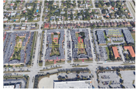
Built in 1970 - 90 units - 2 floors

Number of units: 90 Number of active listings for rent: 2 Number of active listings for sale: 3 Building inventory for sale: 3% Number of sales over the last 12 months: 0 Number of sales over the last 6 months: 0 Number of sales over the last 3 months: 0 New World Condominium III Address: 271 NW 177th St, Miami, FL 33169 Phone: +1 305-999-9700 https://