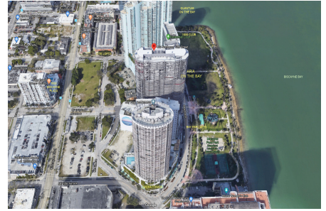
Built in 2018 - 648 units - 52 floors