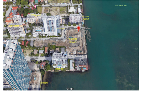
Built in 2017 - 391 units - 52 floors

Biscayne Beach Address: 2900 NE 7th Ave, Miami, FL 33137 Phone: +1 305-356-7443 https://