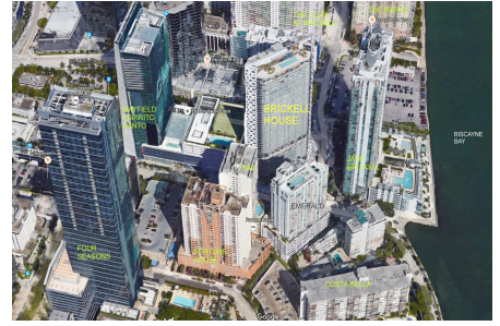
Built in 2014 - 374 units - 45 floors