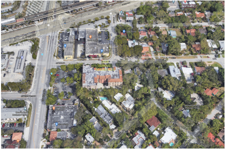
Built in 2004 - 62 units - 4 floors