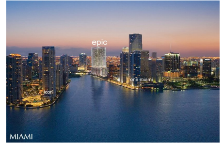
Built in 2008 - 342 units - 54 floors