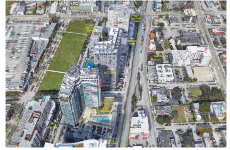
Built in 2013 - 410 units - 38 floors

Number of units: 410 Number of active listings for rent: 27 Number of active listings for sale: 33 Building inventory for sale: 8% Number of sales over the last 12 months: 24 Number of sales over the last 6 months: 11 Number of sales over the last 3 months: 7 Hyde Midtown Condominium Address: 121 NE 34th St, Miami, FL 33137 Phone: +1 786-292-4919 https://