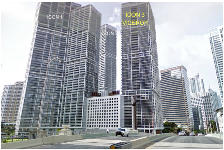
Built in 2010 - 520 units - 48 floors