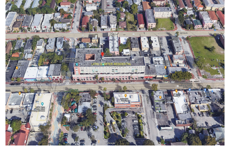
Built in 2004 - 45 units - 6 floors

Latin Quarter Residential Condominium Association 1475 SW 8th St Apt 401 Miami, FL 33135 (305) 285-7052