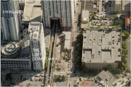
Built in 2005 - 194 units - 23 floors