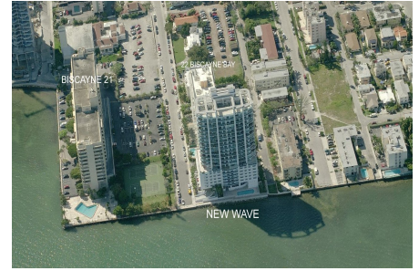
Built in 2006 - 78 units - 19 floors

Number of units: 78 Number of active listings for rent: 1 Number of active listings for sale: 3 Building inventory for sale: 3% Number of sales over the last 12 months: 2 Number of sales over the last 6 months: 1 Number of sales over the last 3 months: 0 New Wave Condominiums (305) 572-9149 https://