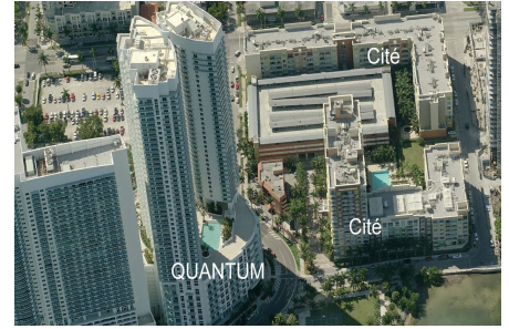
Built in 2007 - 698 units - 51 floors

Quantum on the Bay condominium Association 786.314.7457