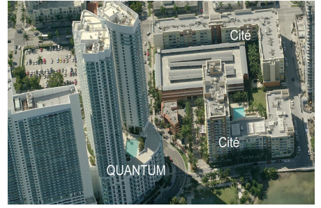
Built in 2007 - 698 units - 51 floors

Quantum on the Bay condominium Association 786.314.7457