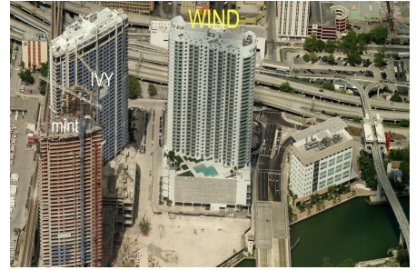
Built in 2008 - 488 units - 40 floors

Number of units: 488 Number of active listings for rent: 18 Number of active listings for sale: 27 Building inventory for sale: 5% Number of sales over the last 12 months: 17 Number of sales over the last 6 months: 5 Number of sales over the last 3 months: 2 Wind by Neo Condominium (786) 837-5968 https://