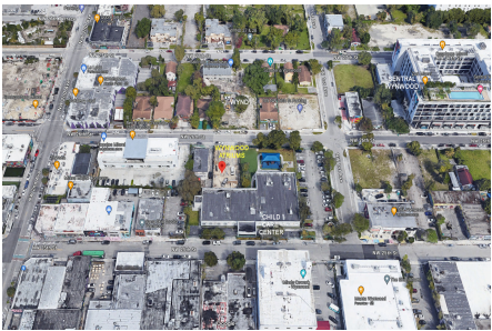
Built in 2022 - 31 units - 5 floors