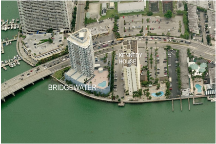
Built in 2006 - 118 units - 20 floors