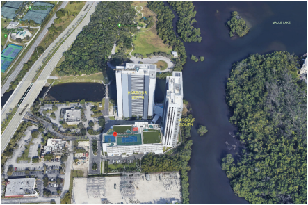
Built in 2018 - 425 units - 33 floors