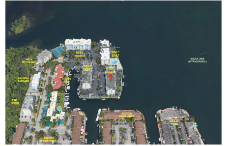
Built in 1980 - 50 units - 6 floors

Reef Club Condominium 16558 NE 26th Ave, North Miami Beach, FL 33160 Phone: +1 305-944-1673 https://reefclub.us/