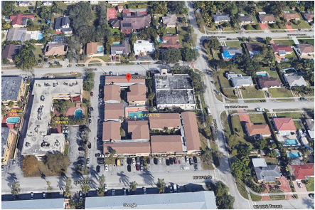
Built in 1962 - 49 units - 2 floors