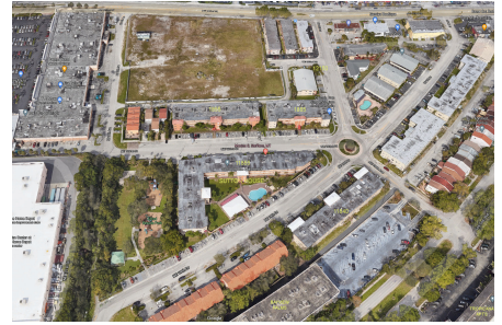
Built in 1963 - 149 units - 3 floors

Number of units: 149 Number of active listings for rent: 6 Number of active listings for sale: 7 Building inventory for sale: 4% Number of sales over the last 12 months: 1 Number of sales over the last 6 months: 0 Number of sales over the last 3 months: 0 Sutton House Apartments Address: 11855 NE 19th Dr, North Miami, FL 33181, Phone: +1 305-891-0553 https://