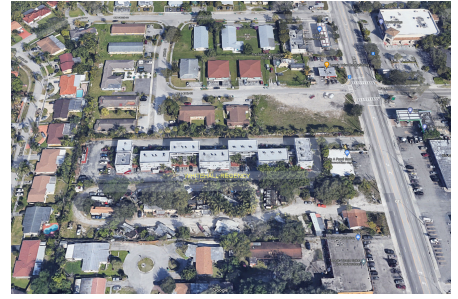
Built in 1989 - 42 units - 3 floors

Number of units: 42 Number of active listings for rent: 0 Number of active listings for sale: 0 Building inventory for sale: Number of sales over the last 12 months: 0% Number of sales over the last 6 months: 0 Number of sales over the last 3 months: 0 Whitehall Regency Condominium Association, Inc 8390 SW 5th Street Miami FL 33144-3514 Phone: (305) 559-9424 https://