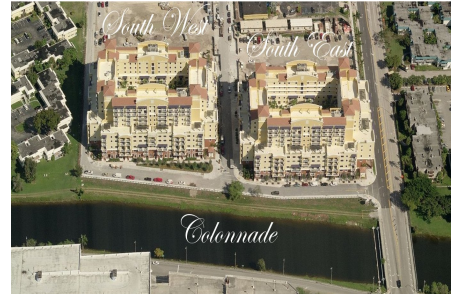
Built in 2008 - 150 units - 10 floors

Number of units: 150 Number of active listings for rent: 1 Number of active listings for sale: 5 Building inventory for sale: 3% Number of sales over the last 12 months: 7 Number of sales over the last 6 months: 5 Number of sales over the last 3 months: 3 Colonnade at Dadeland Condo Association Management Office 8390 Southwest 72nd Avenue Miami, FL 33143 (305) 663-5454 https://