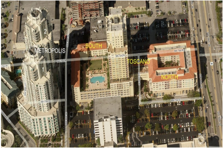
Built in 2007 - 110 units - 7 floors