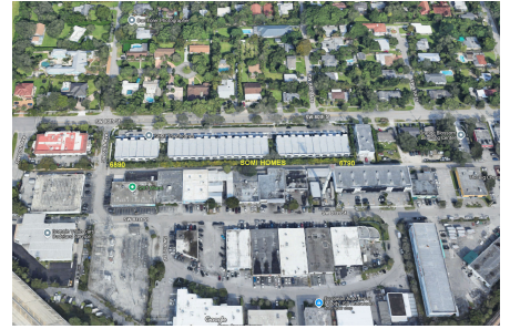
Built in 2021 - 30 units - 2 floors