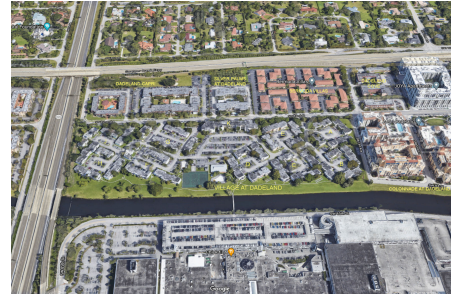
Built in 1968 - 408 units - 4 floors

Village at Dadeland Condominium Association Address: 7440 SW 82nd St, Miami, FL 33143 Phone: +1 305-667-2991 https://