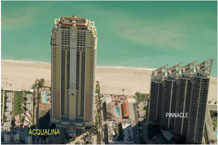
Built in 2005 - 247 units - 51 floors