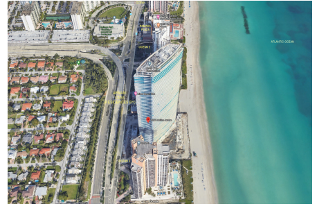
Built in 2019 - 308 units - 55 floors

Residences by Armani Casa Sunny Isles Beach Address: 18975 Collins Ave, Sunny Isles Beach, FL 33160 Phone: +1 786-629-1192 https://