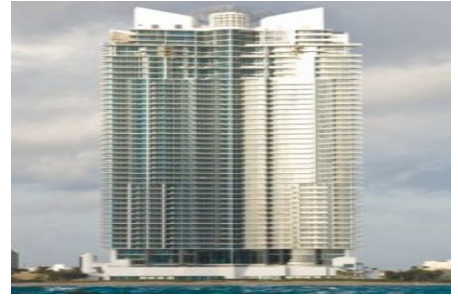
Built in 2008 - 248 units - 50 floors

Number of units: 248 Number of active listings for rent: 5 Number of active listings for sale: 16 Building inventory for sale: 6% Number of sales over the last 12 months: 5 Number of sales over the last 6 months: 2 Number of sales over the last 3 months: 1 Jade Beach Condominium Association Inc (305) 354-0660 https://