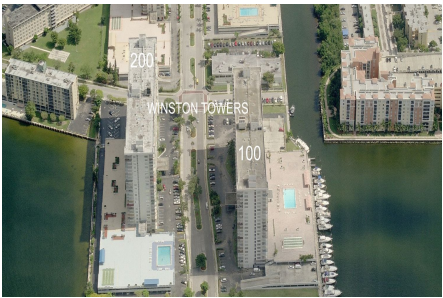
Built in 1970 - 408 units - 22 floors