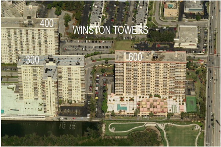
Built in 1981 - 391 units - 23 floors