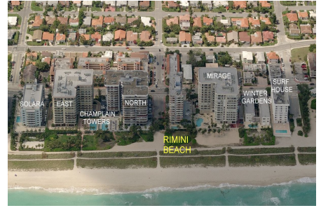
Built in 1988 - 55 units - 12 floors