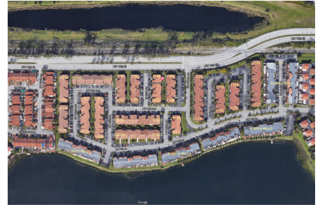
Built in 1996 - 234 units - 2 floors