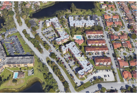
Built in 1983 - 124 units - 4 floors