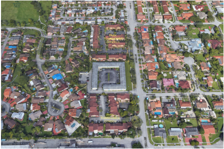
Built in 1981 - 73 units - 2 floors